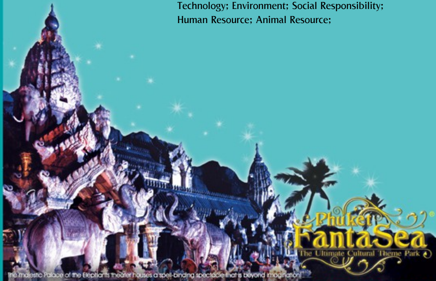
The majestic Palace of the Elephants Theater houses a spell-binding spectacle that is beyond imagination!