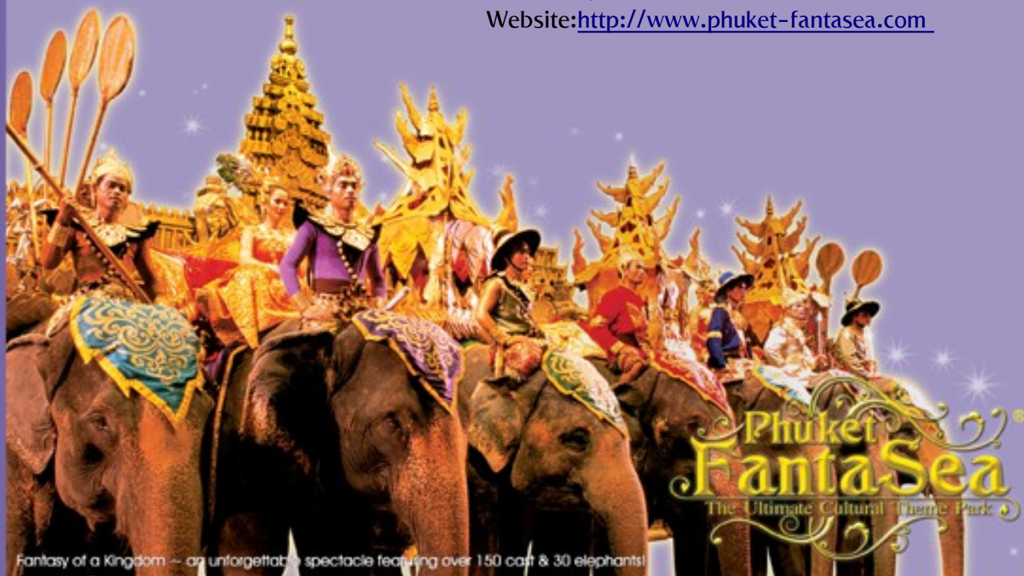
Fantasy of a Kingdom -- an unforgettable spectacle featuring over 150 cast & 30 elephants!

For more information, please contact International Relations Department, Tel: +66 76 385 000; +66 76 680 870 Fax: +66 76 385 333 Email: ir@phuket-fantasea.com Website: http://www.phuket-fantasea.com